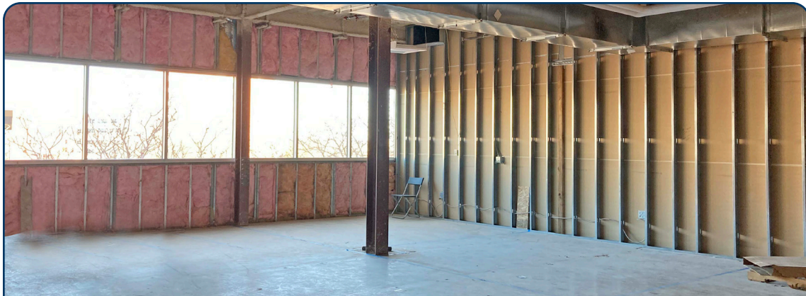
THIRD FLOOR SPACE