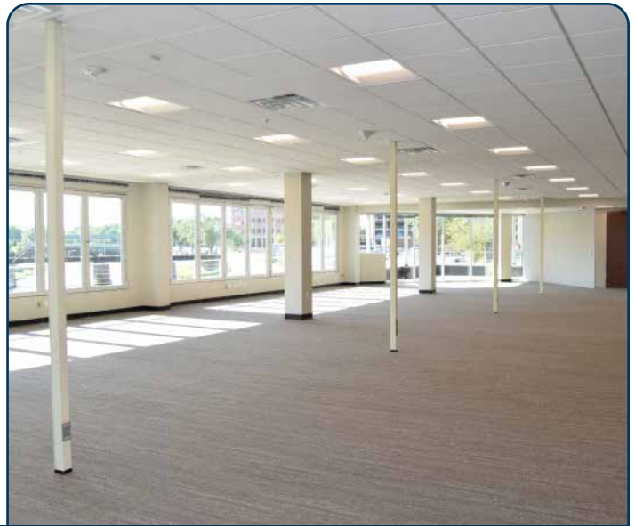
FIRST FLOOR SPACE