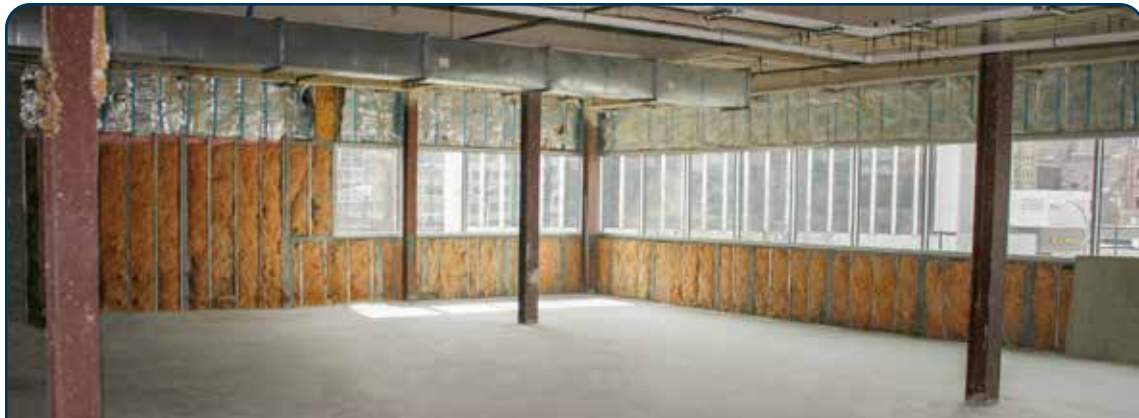
THIRD FLOOR SPACE